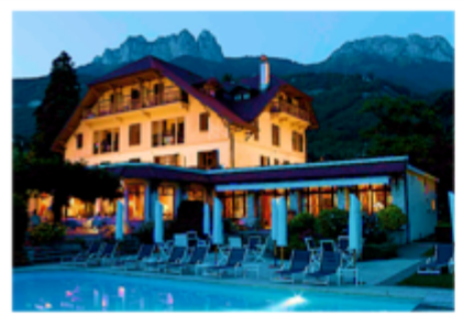
Cottage Bise ****