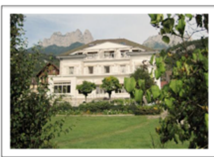
Hotel Beau Site ★★★

When calling to book your room, please mention the "Self-Reflection For Conflict Professionals Seminar" to the receptionist