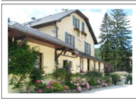
Villa des Fleurs ★★★