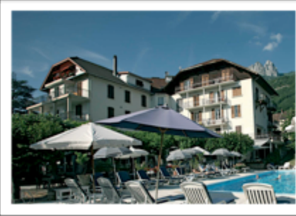
Hotel du Lac ★★★