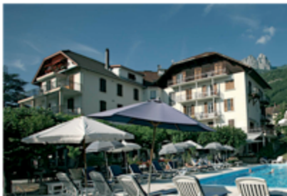
Hotel du Lac ★★★