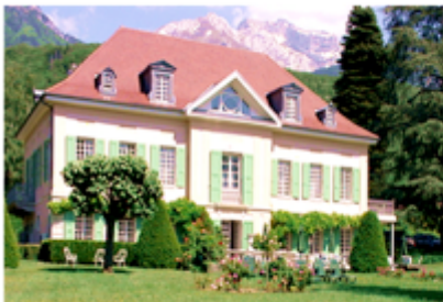
Villa des Roses, Bed & Breakfast