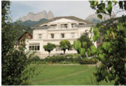
Hotel Beau Site ★★★

When calling to book your room, please mention the “Self-Reflection For Conflict Professionals Seminar” to the receptionist