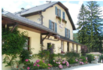
Villa des Fleurs ★★★