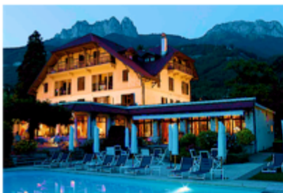
Cottage Bise ★★★★★